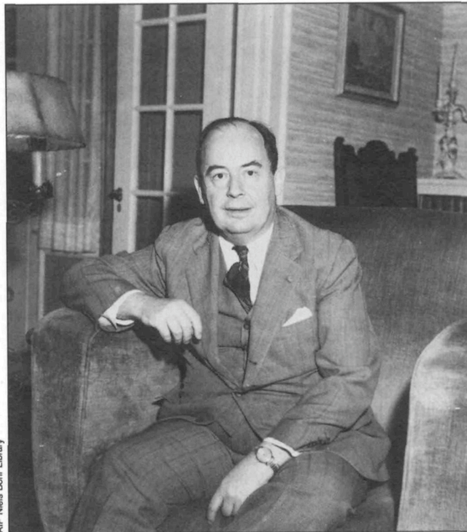
John von Neumann – '... infamous postulate: the measurement act 'collapses' the state into one in which there are no interference terms between different states of the measurement apparatus . . .'

(iii) von Neumann is concerned here with what happens to the state of the system that has suffered the measurement – an external intervention. In application to the extended system S'(= S + A) von Neumann's collapse would not occur before external intervention from R' . It would be surprising if this consequence of external intervention on S' could be inferred from the purely internal Schrödinger equation for S' . Now KG's collapse, although justified by reference to 'all known observables' at the S'/R' interface, occurs after 'measurement' by A on S , but before interaction across S'/R' . Thus the collapse which KG discusses is not that which von Neumann infamously postulates. It is